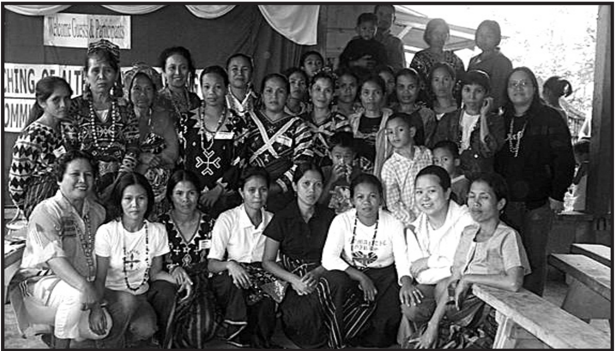
FatK educators together with graduates of functional literacy program